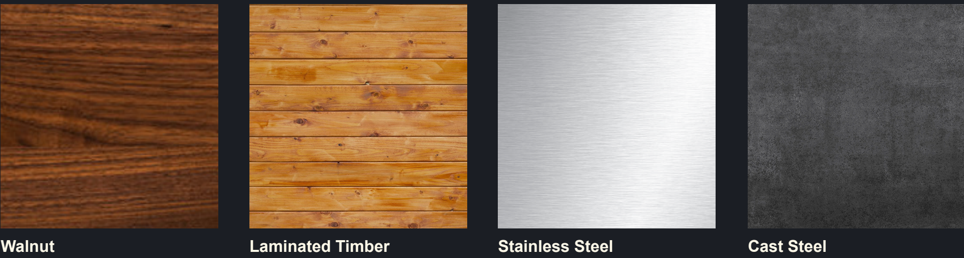
Walnut Laminated Timber Stainless Steel Cast Steel

The minimal appearance of each materials brings natural tone and textures to the space. The use of the contrasting materials, such as panelled wood and cast steel generate a balance in the environment, giving more depth and layers to the space. Also, all the materials create an uniformity with the materials used for the interior space of the building.