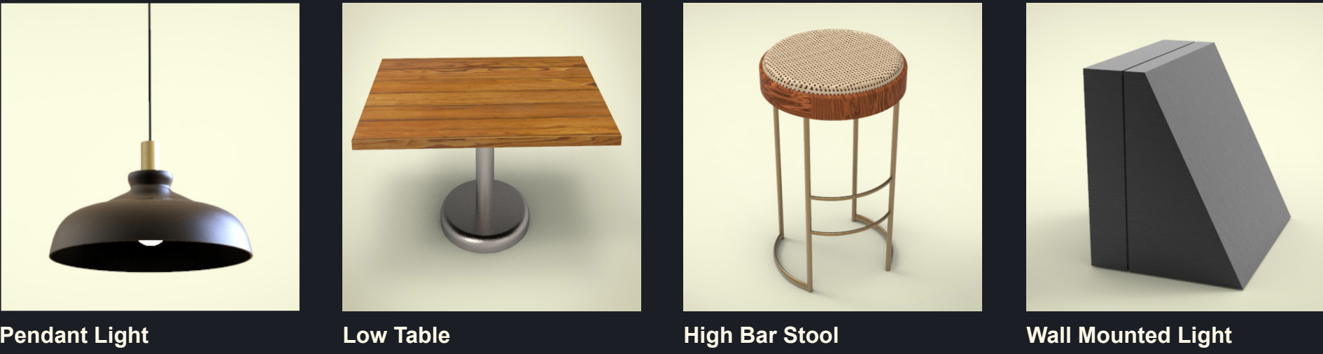
Pendant Light Low Table High Bar Stool Wall Mounted Light

The furnitures and fixtures are modern and minimal. They add compelling details to the space with natural tones and textures that enhance the atmosphere and the overall outdoor experience.