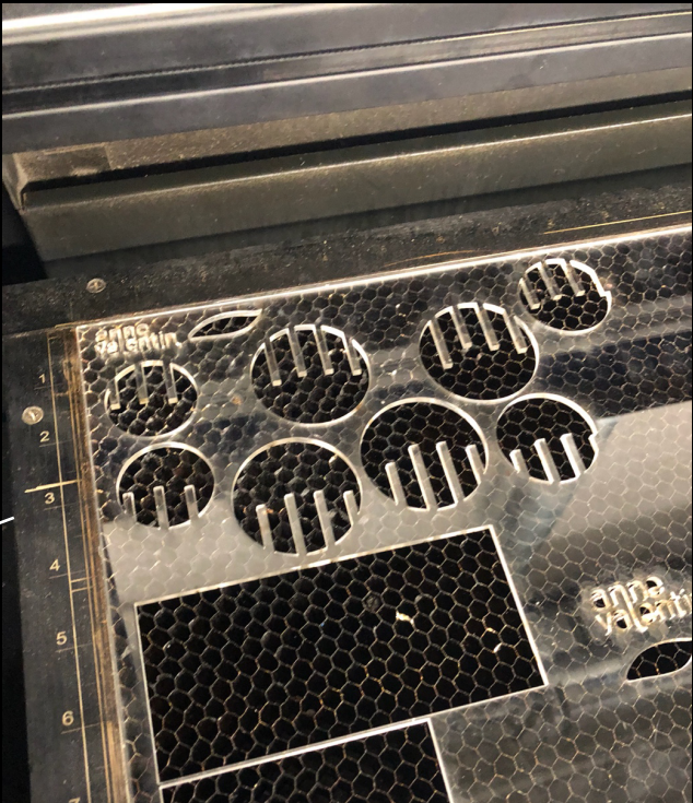
LASER CUT: CLEAR ACRYLIC