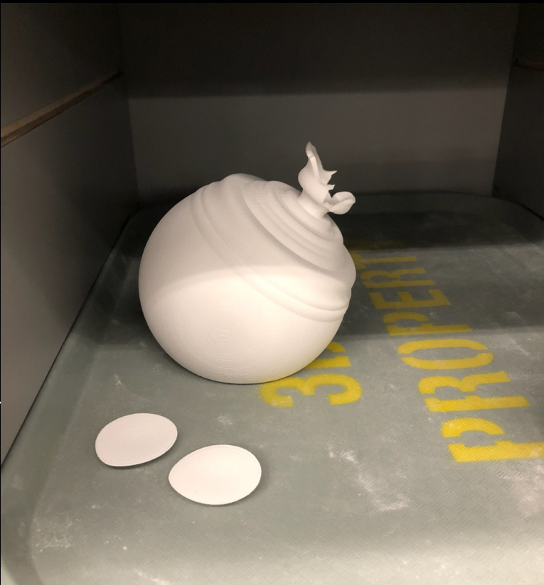
3D PRINT: POWDER